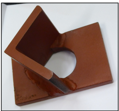
Peter's home made Keat's Block.

Finally, the problem of putting a square peg in a round hole was approached. Peter knew all about it from his apprenticeship. The four corners were first wedged into the round hole so that the rod 'ran true' then specific wedges were precisely made to secure the faces in the hole, the corner wedges were then discarded.