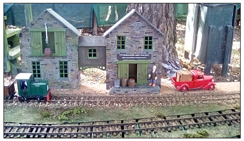
The Tyttenhanger Light Railway goods depot at Welham Green.